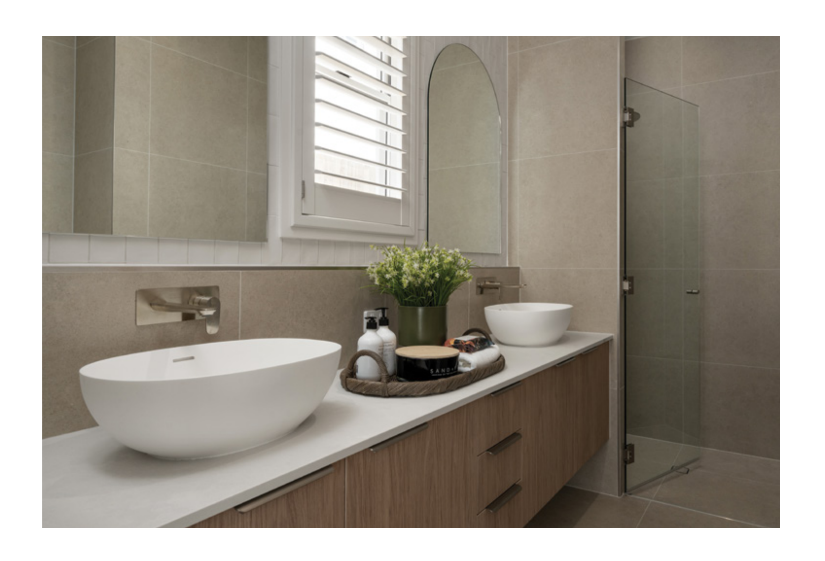
Your dream home is our dream too.