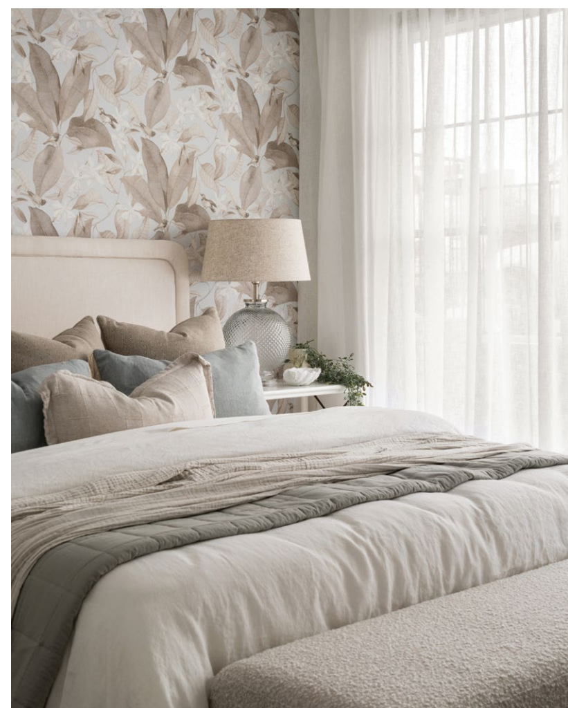
We'll build you the house that's all you want in a home.