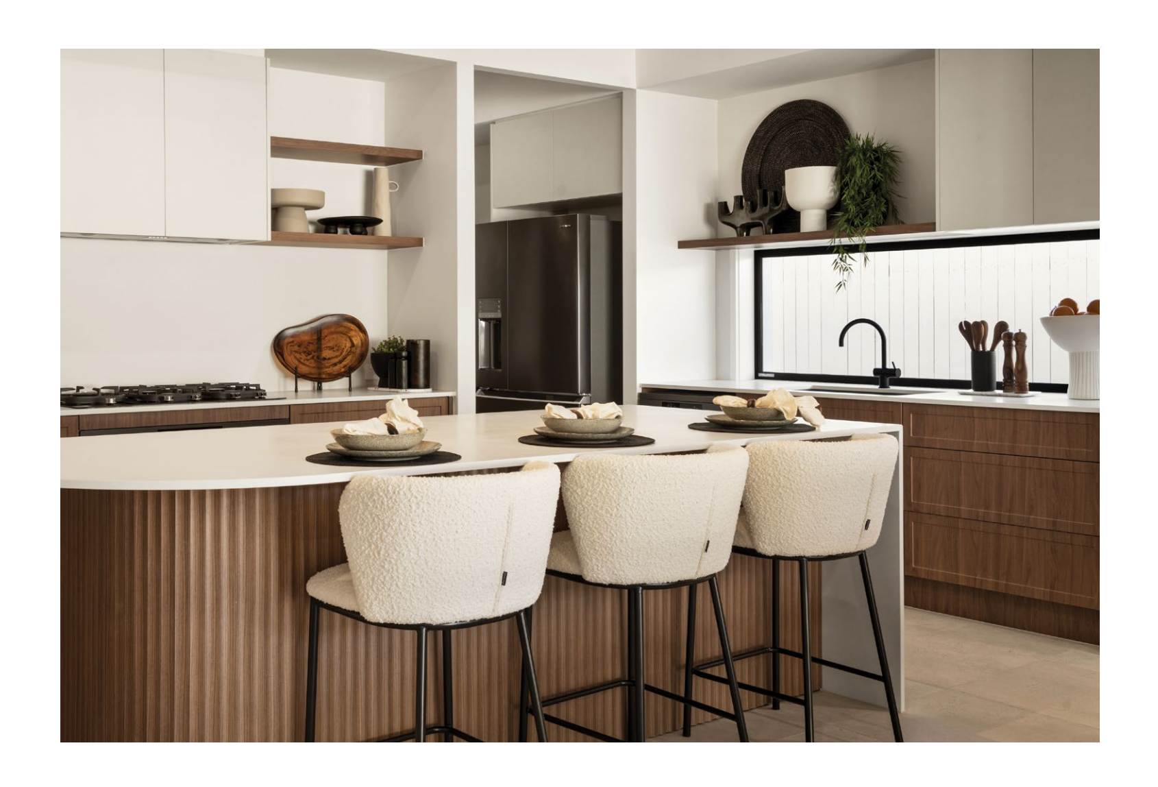
Your dream home is our dream too.