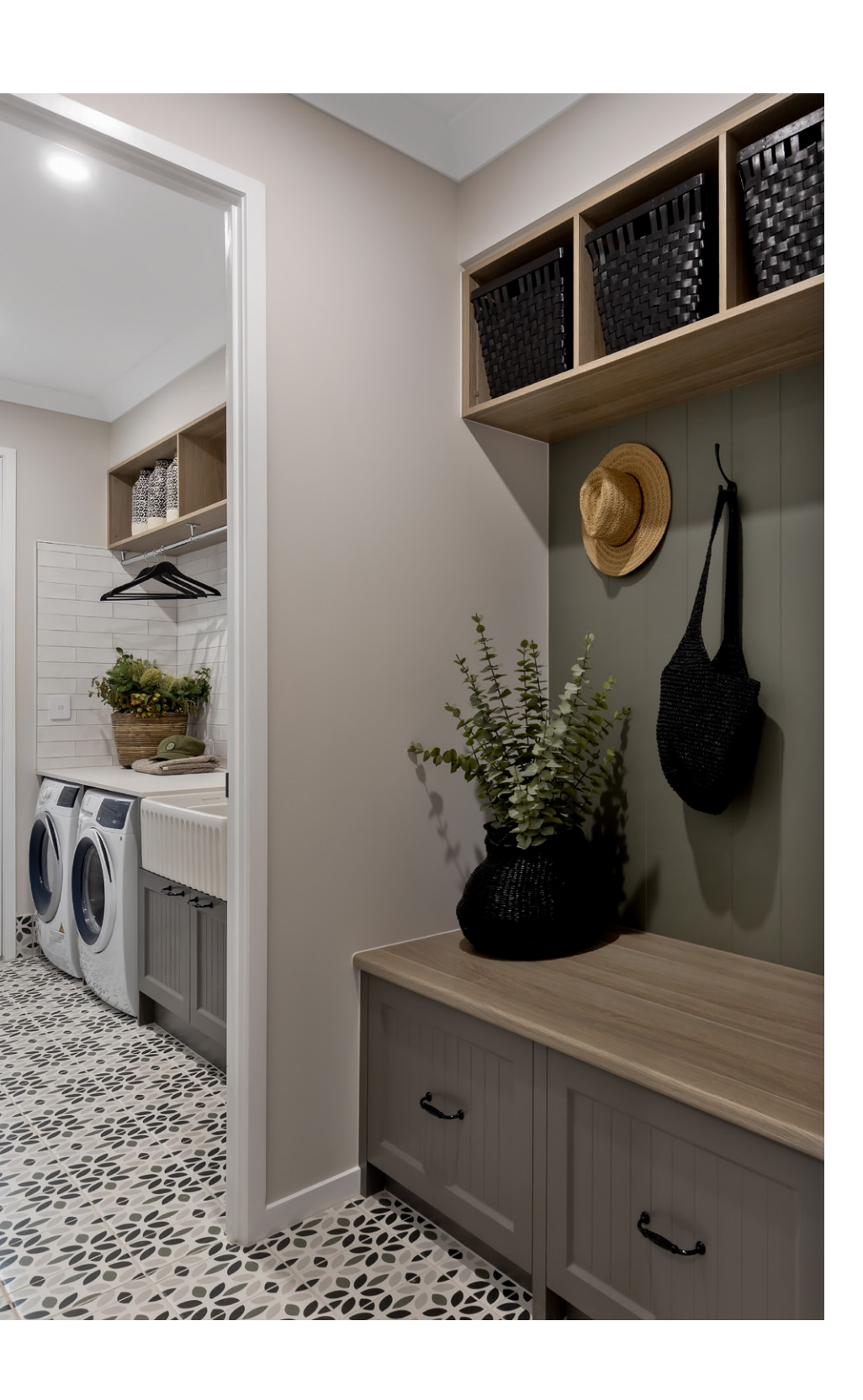
We'll build you the house that's all you want in a home