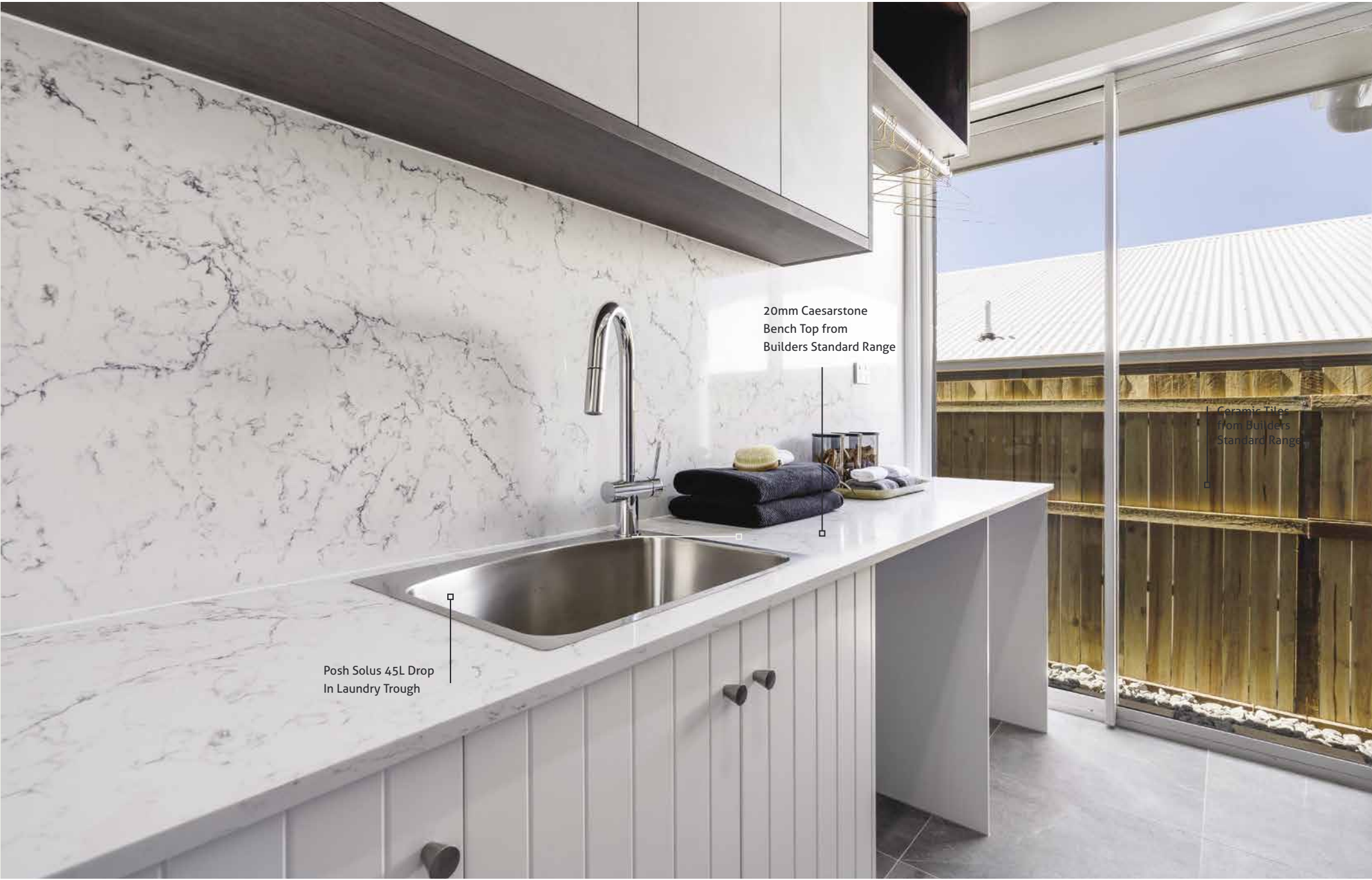
20mm Caesarstone Bench Top from Builders Standard Range