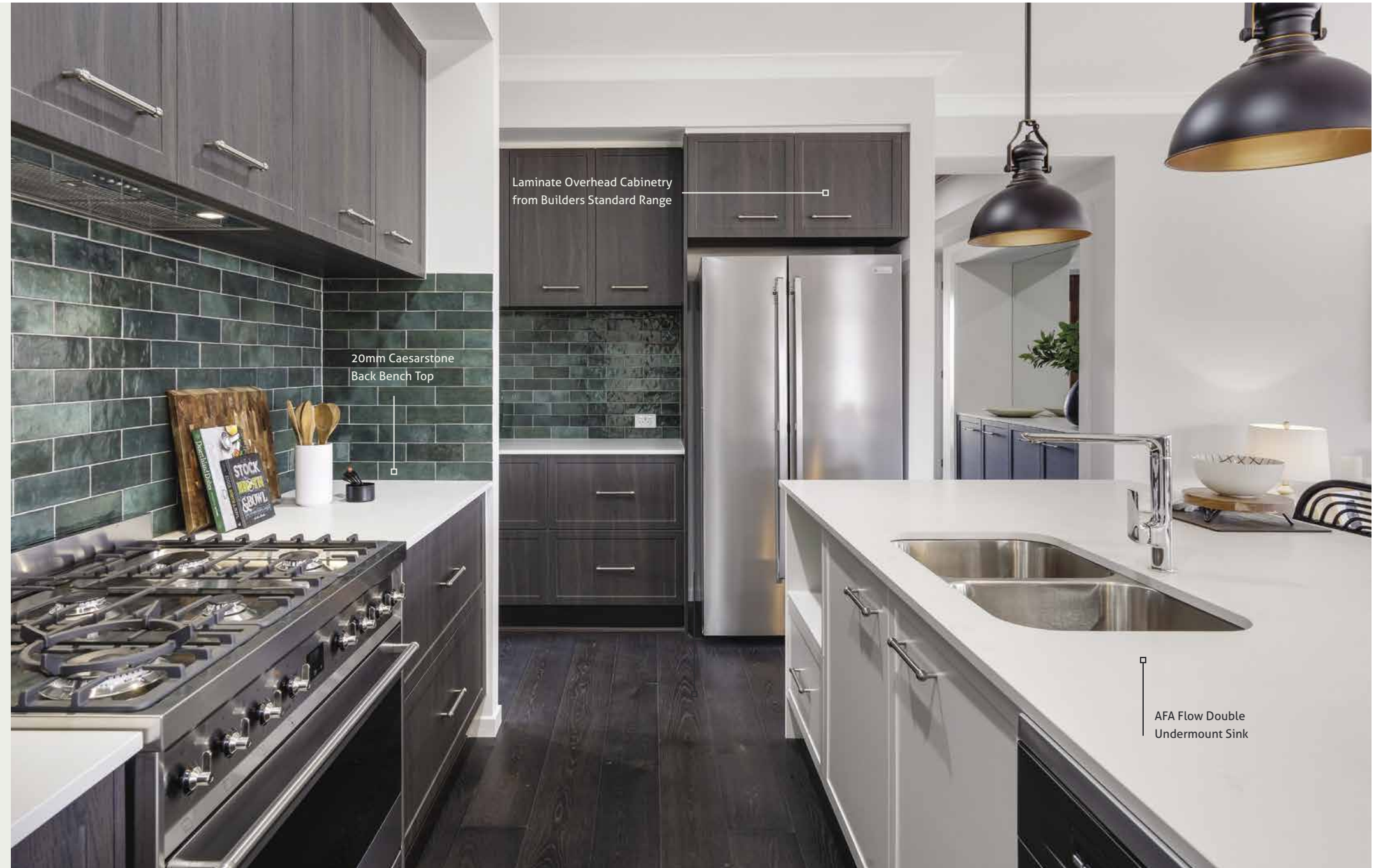
Laminate Overhead Cabinetry from Builders Standard Range