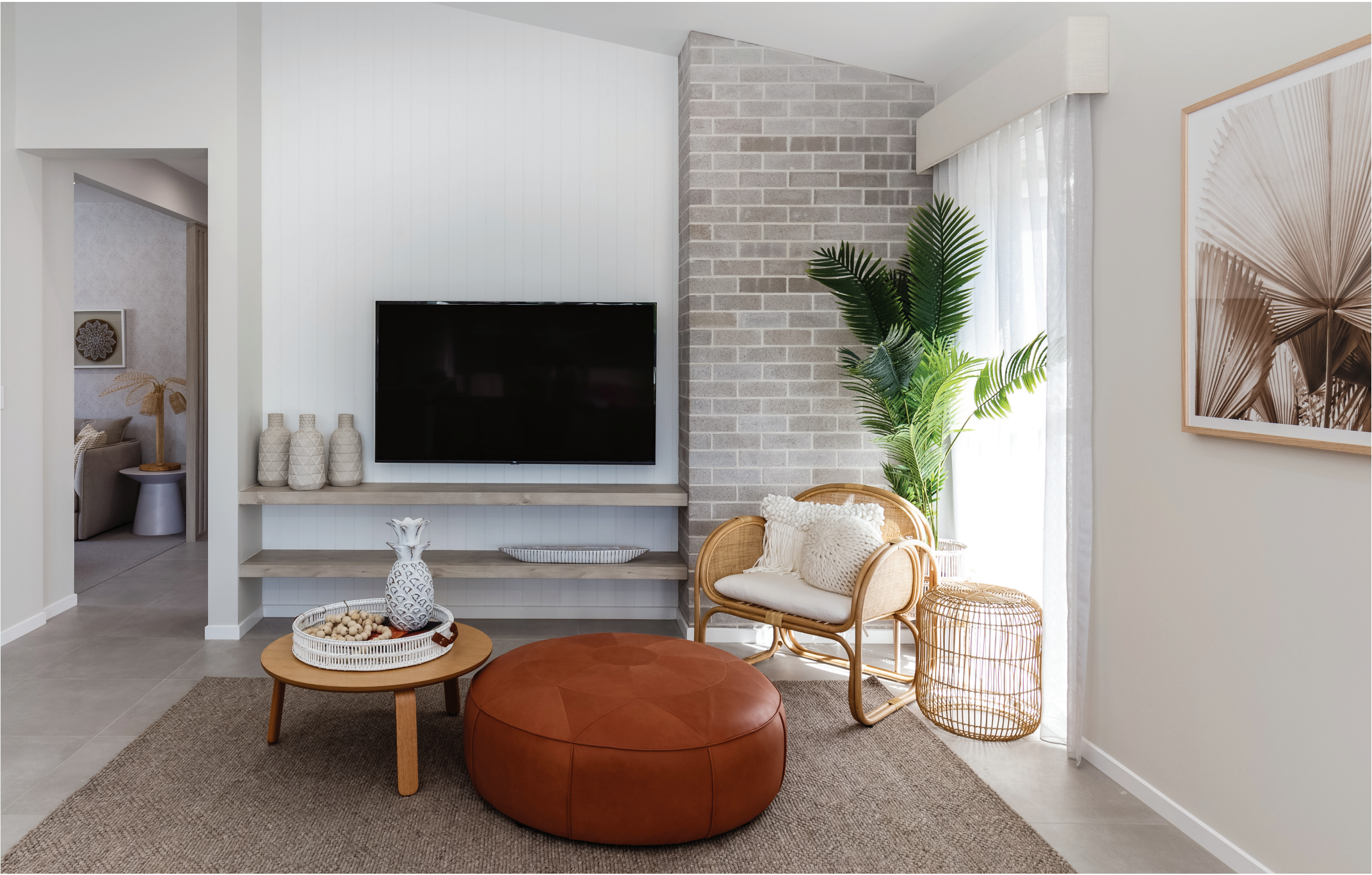
Images shown feature items not included in the Smart Inclusions. Only items listed in the sales and marketing brochure are included as part of the Smart Inclusions. Bold Living reserve the right to alter pricing, materials and specifications without notice.